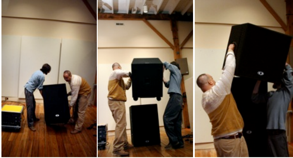
Step Two – Stack left side.